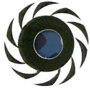
4001 Champagne Gold TO, TA, TU