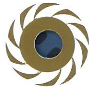
4440S Pirate Gold TA