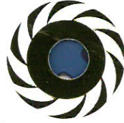
4400 Desert Gold TO, TA