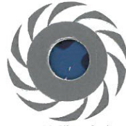
1016S Silver Satin TA