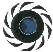
1000 Silver Bright TO, TA, TU